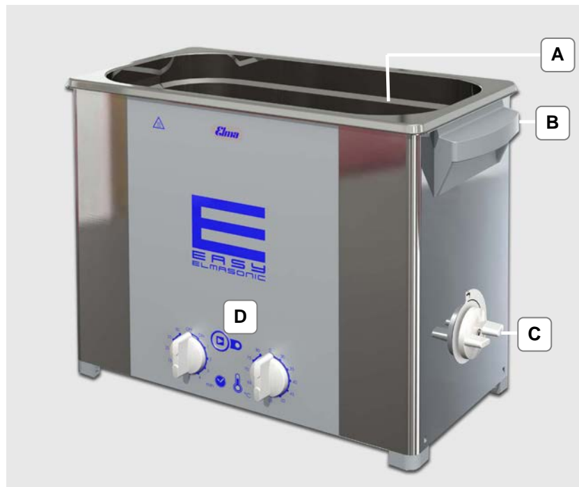
Illustration 4.5 Front view / side view Elmasonic EASY 30 H