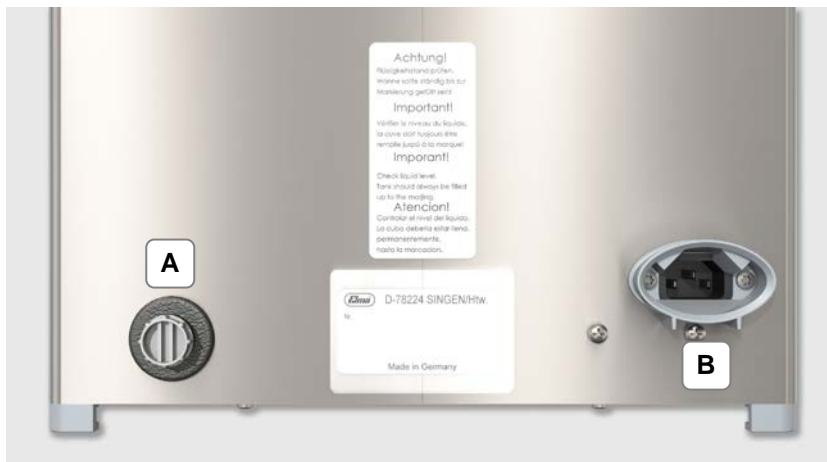
Illustration 4.6 Unit back view (as delivered)