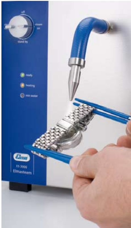
Cleaning of watch straps with fixed nozzle