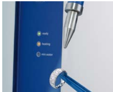
Cleaning of diamonds with fixed nozzle