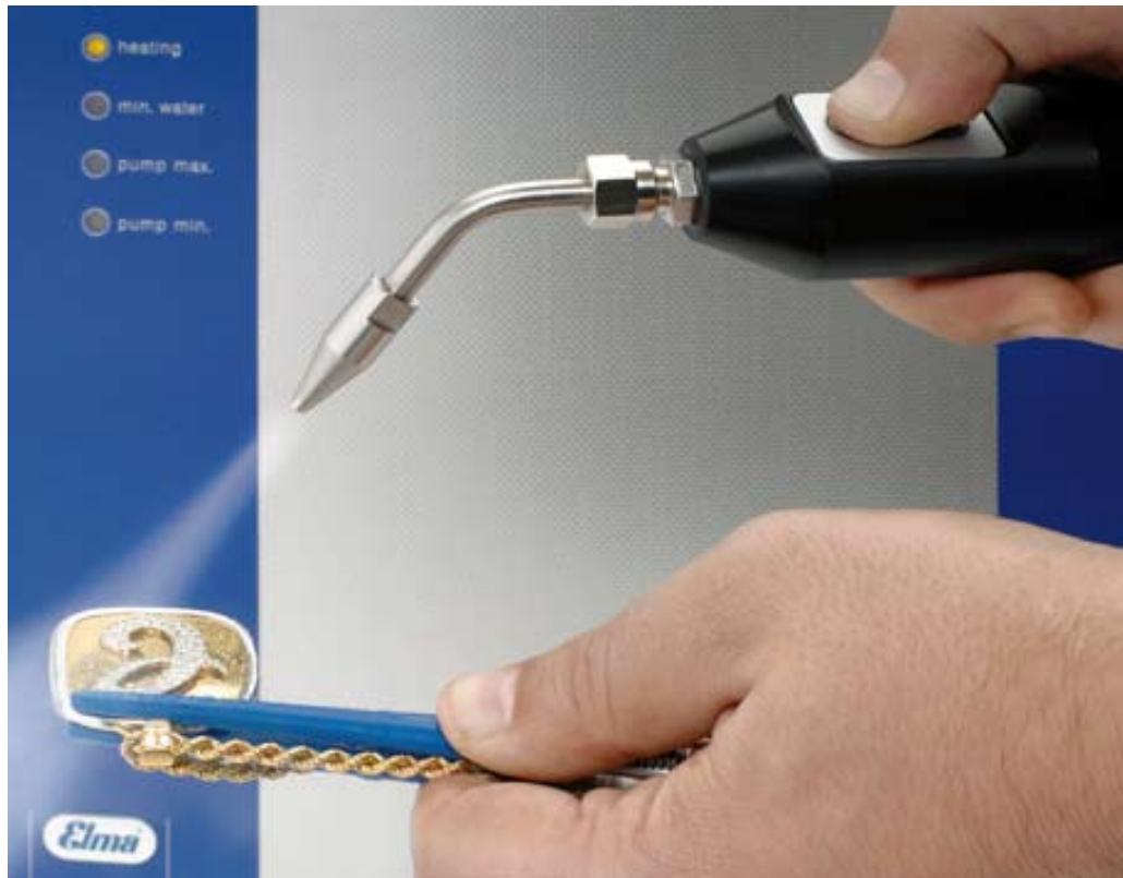
Cleaning of precious jewellery with the hand piece

perfect cleaning results without any chemicals, only with steam minimum waste disposal costs because of highly concentrated, small-volume waste