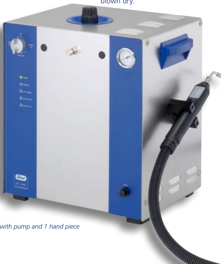
Elmastream 5000 with pump and 1 hand piece

(optional, instead of the fixed nozzle) is perfect for operating at the wash-basin. The handle carries only low voltage to ensure the safety of the operating staff. The operating keys are robust and leak-proof. The special plastic surface is conductive so that no electrostatic charges can build (the electric current is continuously branched off).