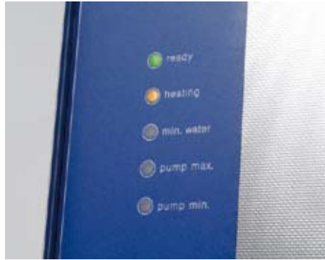
LED lamps on a unit with connected pump