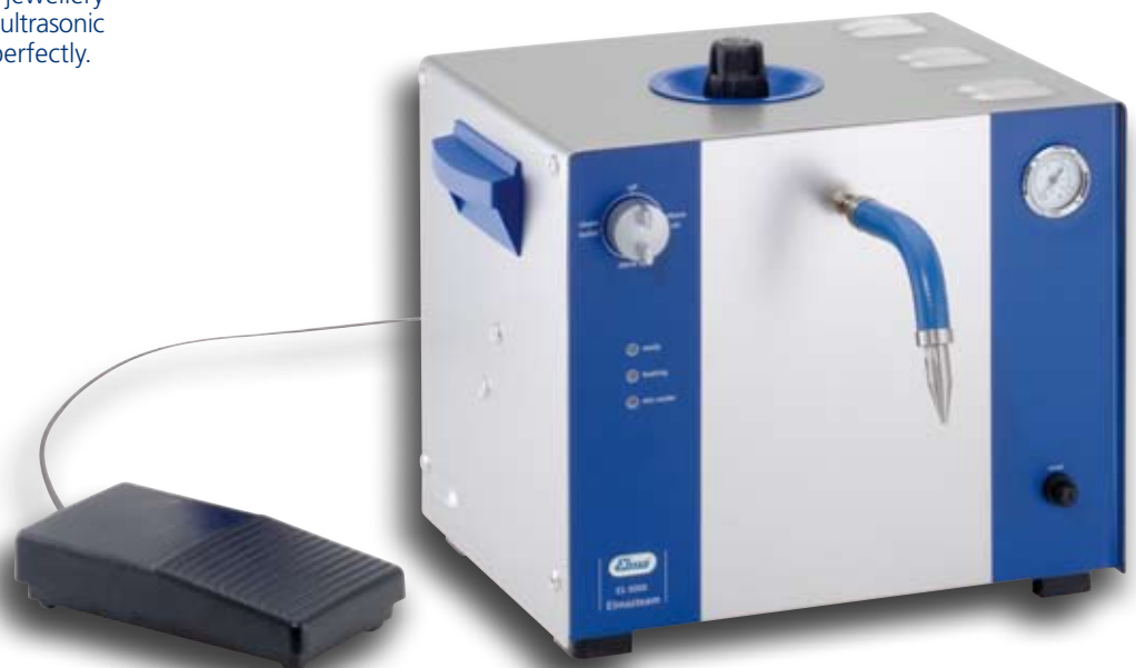
Elmasteam 3000 with fixed nozzle / foot activator

Why do the Elmasteam units operate at a pressure of 8 bar? The standard household steam cleaners operate at a pressure of only 3 to 4 bar. There is usually a significant pressure fall after only a few seconds. The Elmasteam 3000 and 5000 are units made for the professional use operating at a pressure of 8 bar. The high pressure remains constant over a long period and is relatively dry. relatively dry.